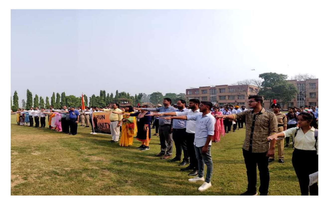
Rally: Our hon'ble Vice Chancellor and Pro Vice Chancellor flagged off this rally